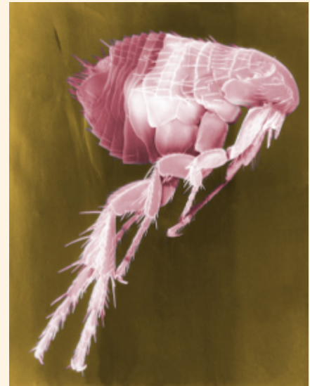
shutterstock_242816170.jpg Scanning electron micrograph of a flea. Fleas carry diseases including the Black Plague, caused by the bacterium Yersinia pestis.