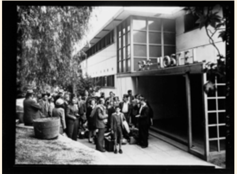
British migrants arriving at the Elder Park migrant hostel, 1948