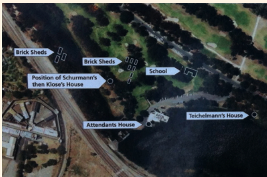
Close-up map of Piltawodli