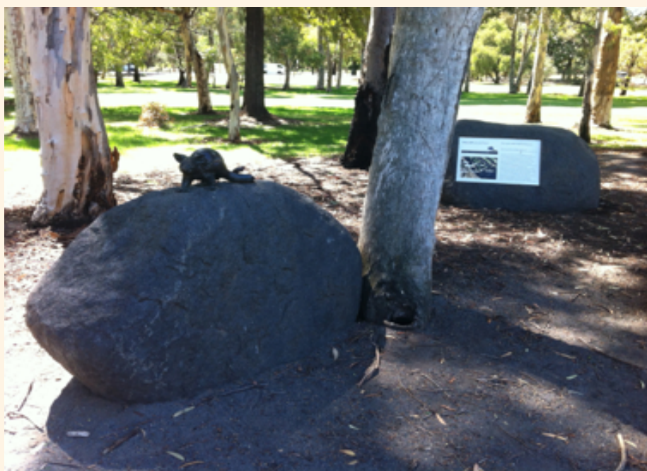
Memorial of Piltawodli (Kurna word for 'Possum House,' the 'Native Location' and school for Kurna children by the Torrens River next to the weir and North Adelaide Golf Links. The school was run by German missionaries and linguists between 1838 and 1845.