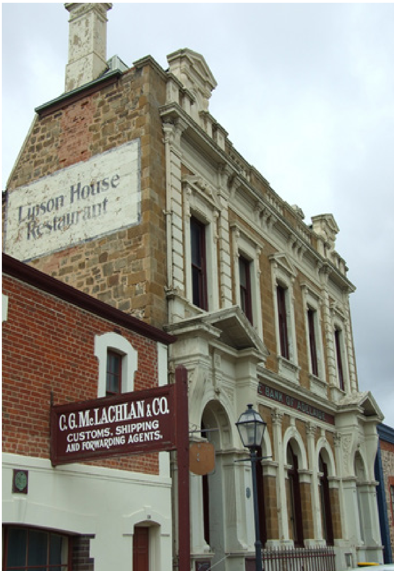
Lipson Street, Port Adelaide