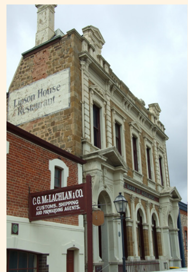
Lipson Street, Port Adelaide Photo: Tamsin Slater, March 2009 CC-BY-SA

See Appendix 2 for a larger version of this photo. BY-SA