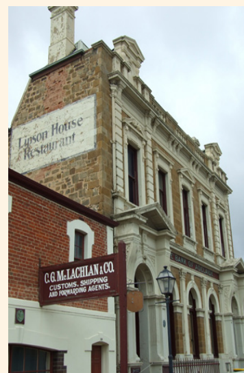
Lipson Street, Port Adelaide Photo: Tamsin Slater, March 2009 CC-BY-SA

See Appendix 2 for a larger version of this photo.