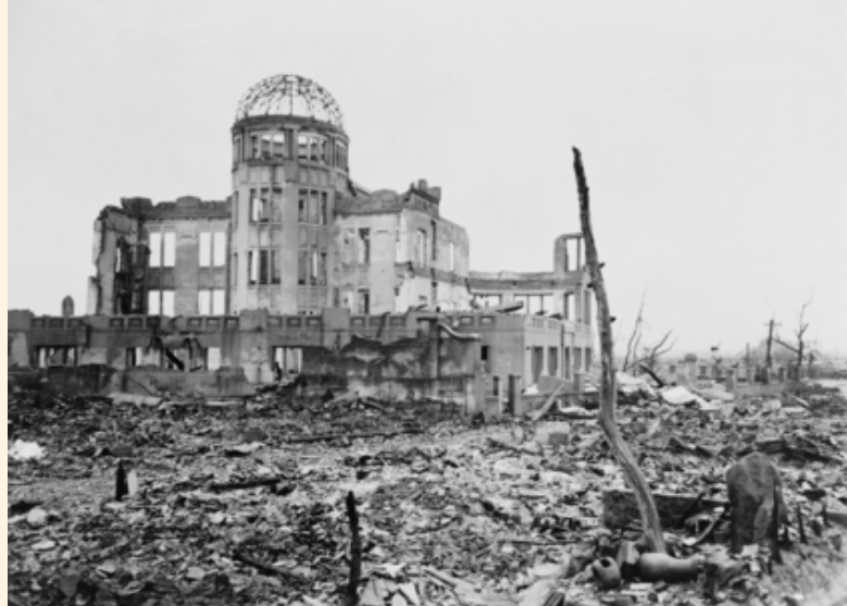
shutterstock_251930719.jpg Wrecked framework of the Museum of Science and Industry in Hiroshima, Japan. This is how it appeared shortly after the dropping of the first atomic bomb, on August 6, 1945.